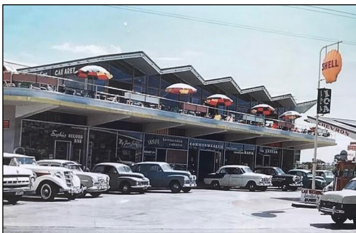
The Chevron Hotel in 1962, venue for the first Gold Coast Congress.