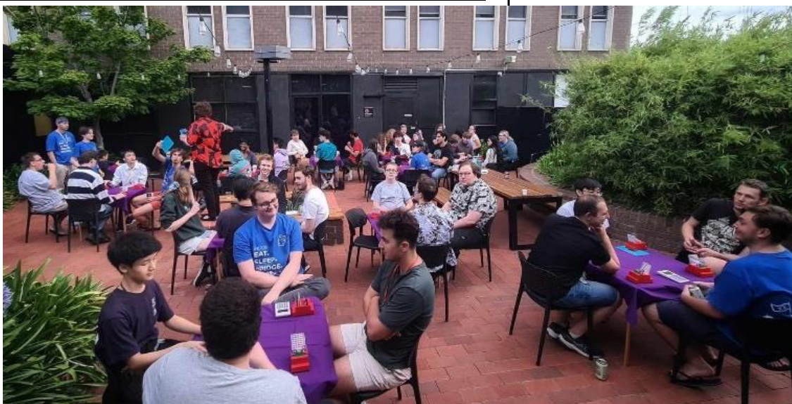
Crazy Pairs Al Fresco

In the second and third layouts, the ♦9 and ♣8 in dummy are effectively worthless. We cannot pick up Qxxx onside, but we can pick up a singleton Q offside. The percentage play is to play off a top card from dummy, cross back to hand and then finesse the J.