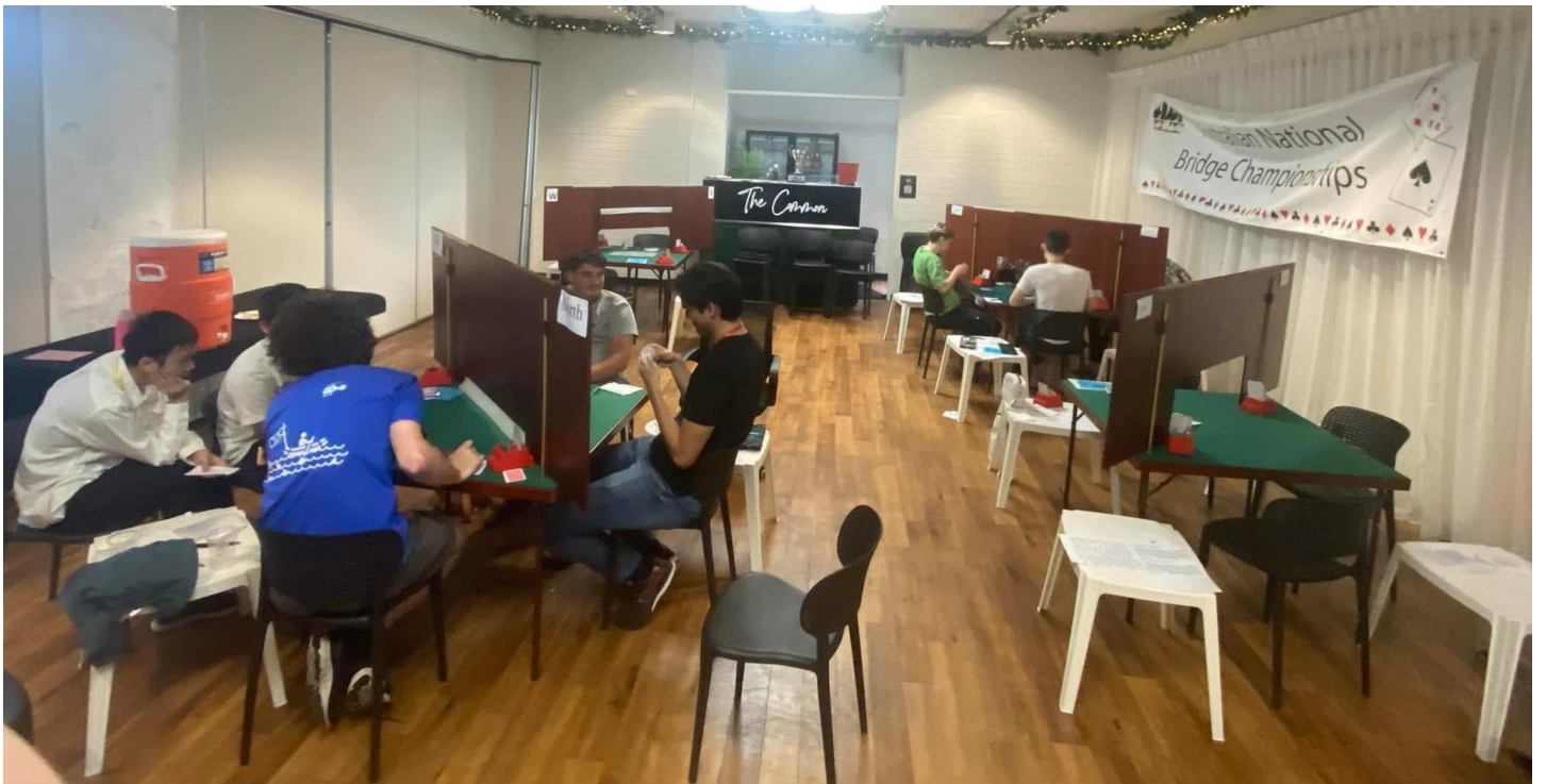
Trans-Tasman Challenge in progress